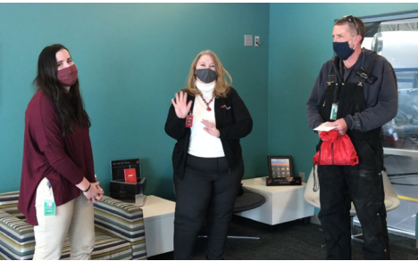
Pictured clockwise: Builder’s Supply, Rotella’s Bakery, Duncan Aviation.